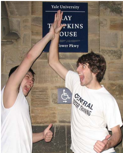
Two students celebrate Yale's academic richness with "the five."