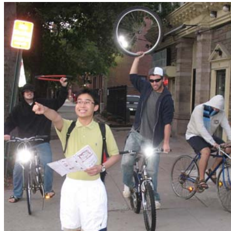
A Yale student enjoys New Haven.