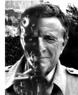
Artist's rendering of Vincent “The Skull” Scully v 2.0.

Vincent Scully: The Sterling Professor Emeritus, History of Art, will be refitted with cyborg technology, securing him another century of iron rule over the world of art history, this one even more ruthless than the last.